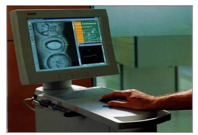
Figure 1: Cerec System

The CEREC (Ceramic Reconstruction) system (Siemen/sirna corp.) was originally formulated by Brains A.G. in Switzerland and first demonstrated in 1986 but have been repeatedly described since 1980. Defined as CEREC CAD/CAM system, it had been produced in West Germany and marketed by the Siemens group (Fig 1).